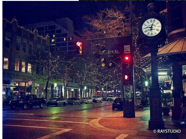
Sundance Square Plaza, Japanese Tea Garden, National Cowgirl Museum, Water Gardens, Sundance Square shops