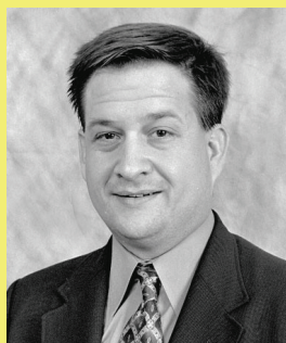
Jim Eck Nominating Committee