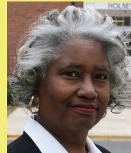
Alice Simpkins Nominating Committee