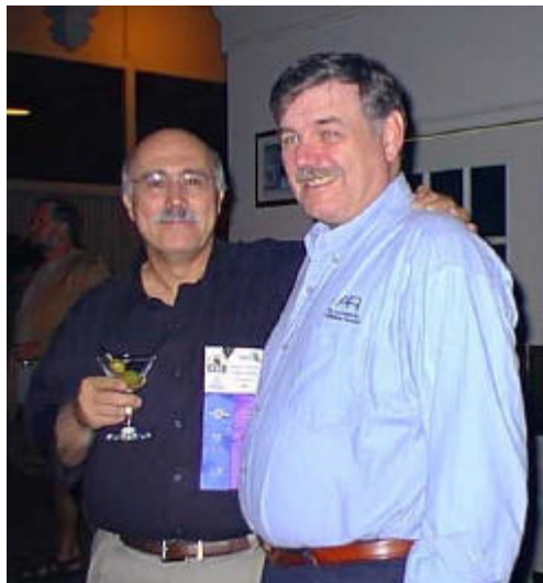
There can never be too many Gerrys!