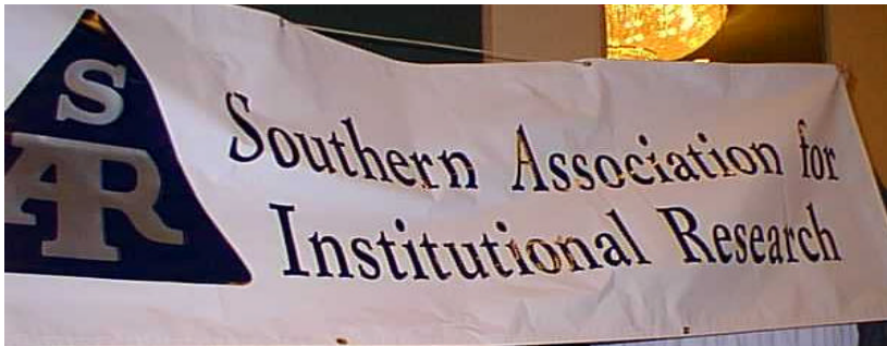
A gift from the Dinosaurs, SAIR's past presidents.