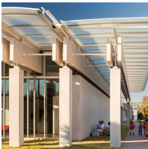
Kimball Art Museum

Hero. The nomination process can be found on page three of this newsletter. Also, be sure to submit your Electronic Fact Book and Website information for review in the annual awards competition.