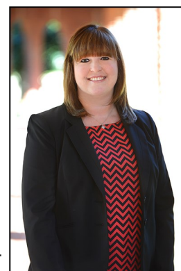
Looking forward to Fort Worth, October 2017