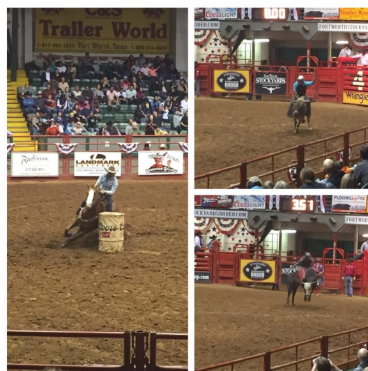
Fort Worth Stockyard Rodeo

In this newsletter you'll find several notable items including key deadlines. For those who may have budget challenges, the travel grant deadline has been extended to August 18. Information on the application process can be found on page six of this newsletter. Also, it is time to nominate your colleagues for service awards by September 1 – nominations for the James Montgomery Outstanding Service Award, Distinguished Member, and Unsung