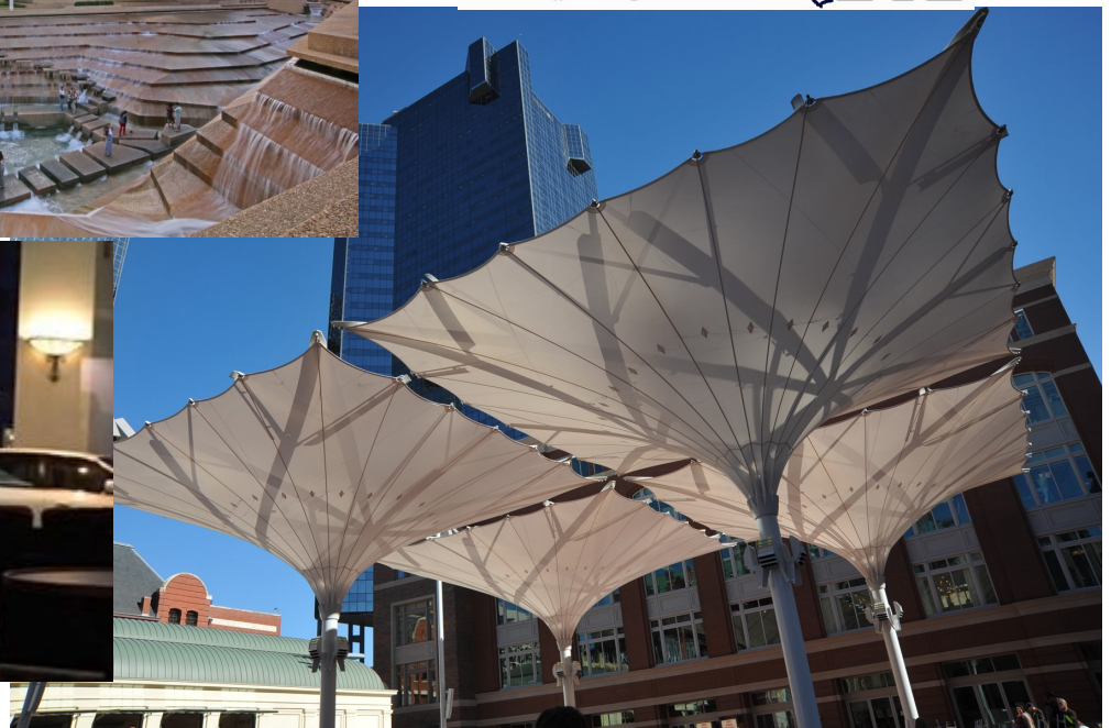
Renaissance Worthington Hotel, Sundance Square Plaza, Water Gardens, Thuh VP/translucent hat, Sundance Square umbrellas