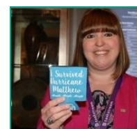
I (We) survived Hurricane Matthew

I am grateful to have worked with an excellent SAIR Board of Directors and SAIR Conference Planning Committee. Thank you for your tireless efforts and countless contributions. Also, I was fortunate to receive tremendous support from the Local Arrangements Committee. The Special Event at the NASCAR Hall of Fame, sponsored by NCAIR, was such fun.