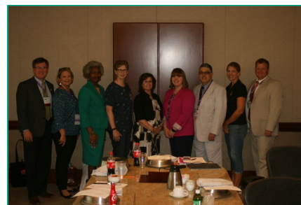
SAIR Board of Directors 2016-2017

To all conference attendees, thank you for participating at the conference and networking with your colleagues. Many of you volunteered your time and served as track chair, reviewed proposals, facilitated sessions, worked