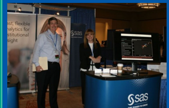
Platinum Sponsor SAS